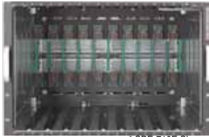
* SBE-710E Shown