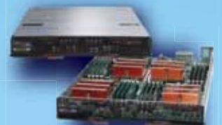
4-way AMD Processor Blade