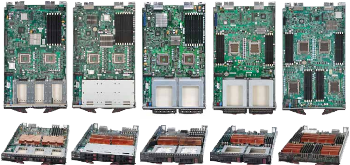
S3E version photo shown

4-way Opreton Blade featuring PCI-E 2.0 and QDR InfiniBand