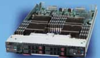
TwinBlade w/ Two 2.5" Hot-plug Drive Bays per DP node

Enterprises, Financial Services, Databases, Datacenters, Research Labs, High Performance Computing & Offices