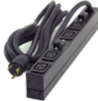
Figure 3 - MCP-520-00036-0N Power Distribution Unit (PDU) with NEMA L6 plug

As an example, the 2000 Watt power supply can draw up to 13.6 Amps. Thus, for a single 30 Amp circuit supplying a PDU, no more than 2 power supplies may be connected to the PDU.