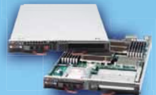
Intel DP Blade w/ PCI-E 2.0 x16 Expansion Slot