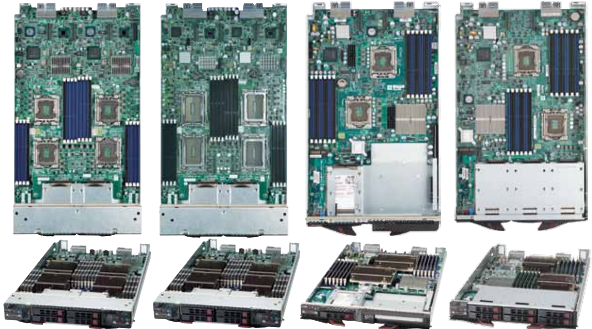
Tylersburg/Westmere Storage Blade w/ 6 SAS2.0 HDD Support and QDR InfiniBand