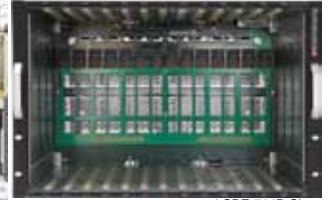
* SBE-714D Shown