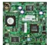
SBM-CMM-003 Mini CMM to be installed in SBM-IBS-Q3616M