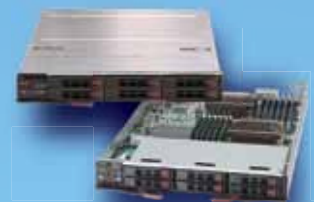
Intel DP Blade w/ Six 2.5" Hot-plug Drive Bays